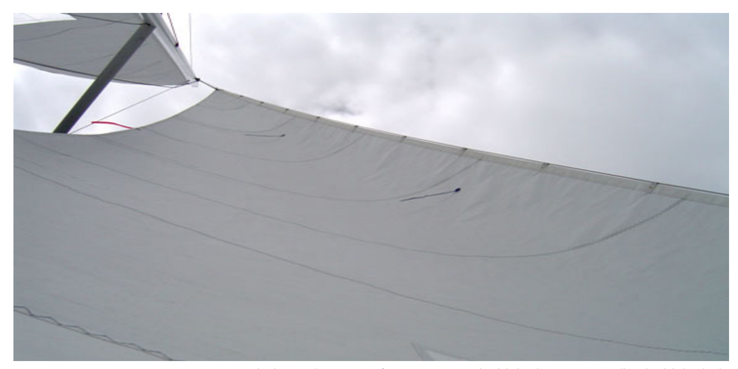
Like the main, be conscious of not over tensioning the jib halyard. However, never allow the jib halyard to be eased enough that there are scallops between the snaps. There should be slight wrinkles off each snap but they should not be extreme.

breezy conditions, ease the sheet for more twist in the leech. Generally speaking, the jib leech telltale should be flying but just about to start stalling. In the bigger breeze, however, this telltale will be less likely to stall because the jib is eased. Note that trimming the jib harder for short periods of time (where the middle batten is slightly hooked to windward of parallel to the centerline) is only effective in "ideal" boat-speed conditions (medium winds and flat water) because it narrows your steering "groove."