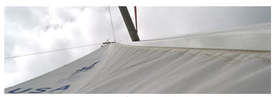
1"-3/4" of sag to leeward indicated proper lower shroud tension